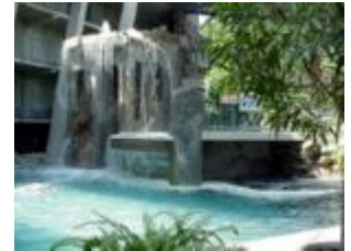
The indoor pool at the Glenstone Lodge

kids, and a variety of museums. See the article below for specific information on the attractions, and join us July 18-20 th for some "Lively" fun!